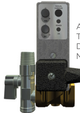
Adjustable Timed Electric Drain for HPRN Models 75 - 150 scfm