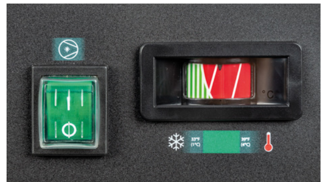
Controls: Models 75 - 150 scfm