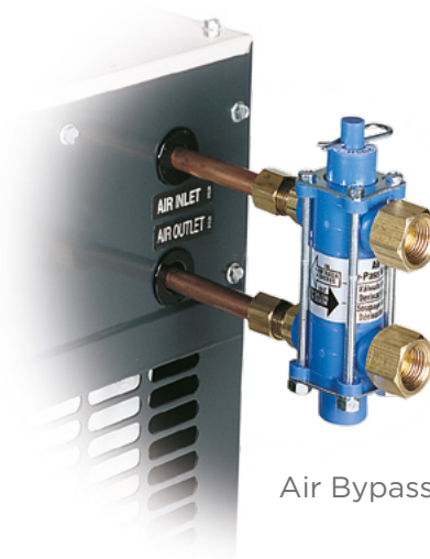
Air Bypass Valve