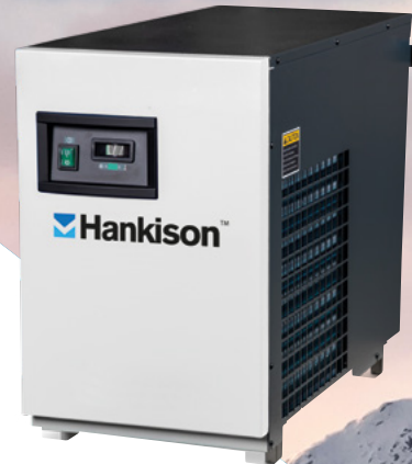
Model Shown Above: HPRN75